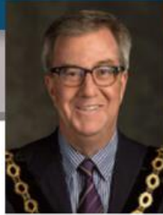
Mayor Jim Watson City of Ottawa