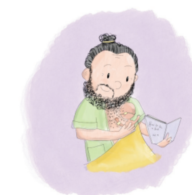
সরীরে সাথে শরীর লাগানো ওখবা জড়িয়ে ধরা