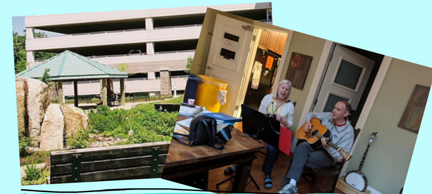
Outdoor Ice Cream Music Night with NICU families and graduates