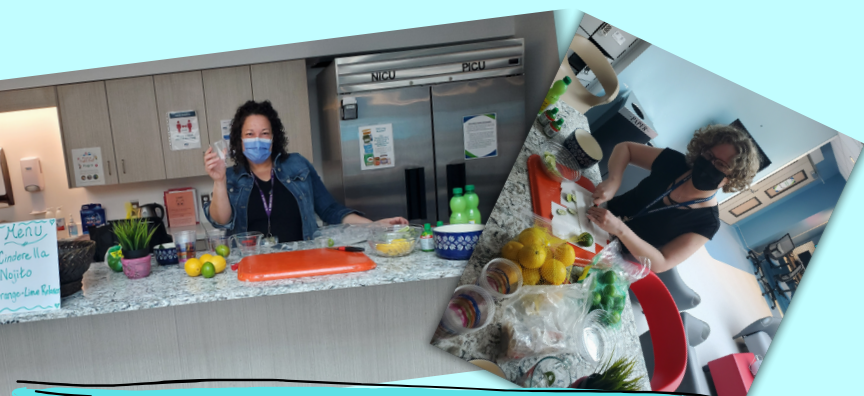
Mothers' Day Mocktails and Fathers' Day Gaming Night

With COVID Restrictions in place, the thriving IWK NICU Parent Partner Program (PPP) came to a near-halt. Our team quickly had to come up with creative ways to maintain a level of peer support and keep family voice present in the Health Centre. Some changes have positive elements but by and large, the Program was struggling. Now, with the world opening up again, the PPP is moving full-steam ahead!