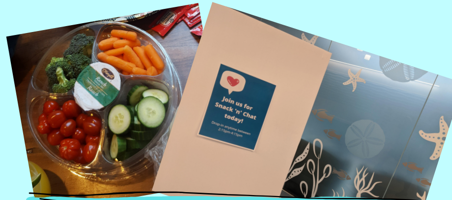
Weekly in-person Snack 'n' Chat resumes